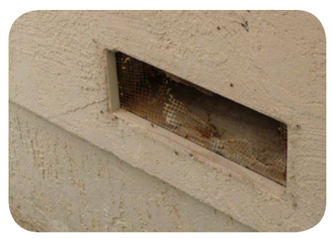
Before: Old Rusted Out Vents