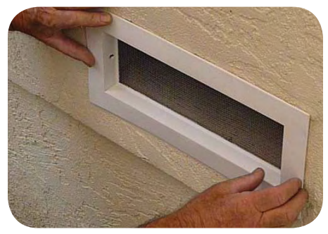
After: Installed EVRvent